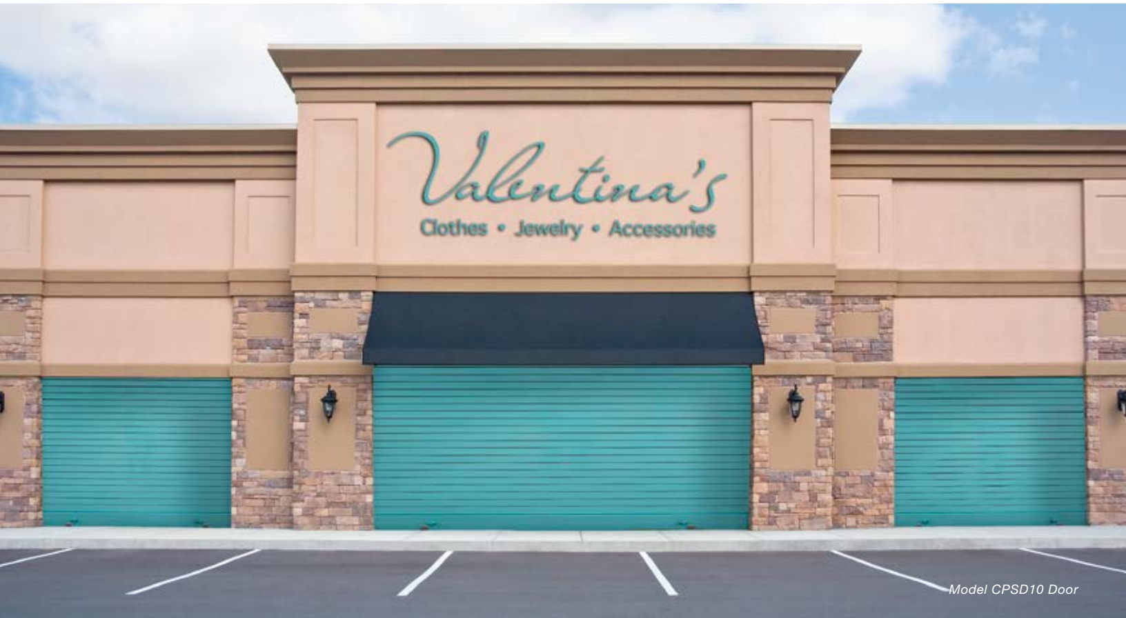
Model CPSD10 Door