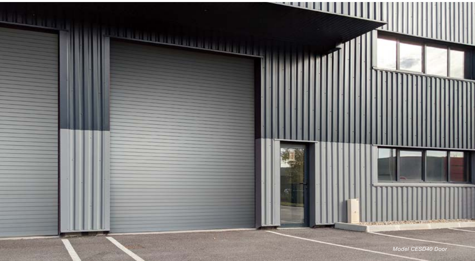
Model CESD40 Door